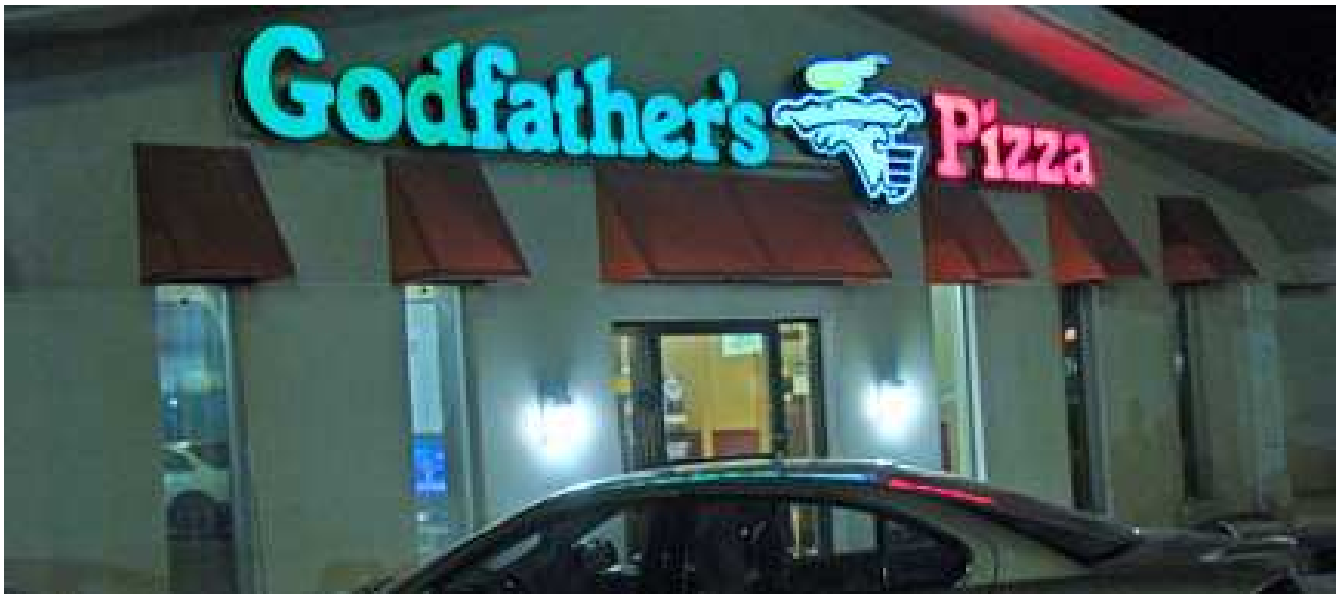
More photos inside.

This is where it all happens each month. We appreciate the opportunity Godfather's has extended to us over the past (near) thirty years. Their Party Room has evolved into 'our' Party Room!