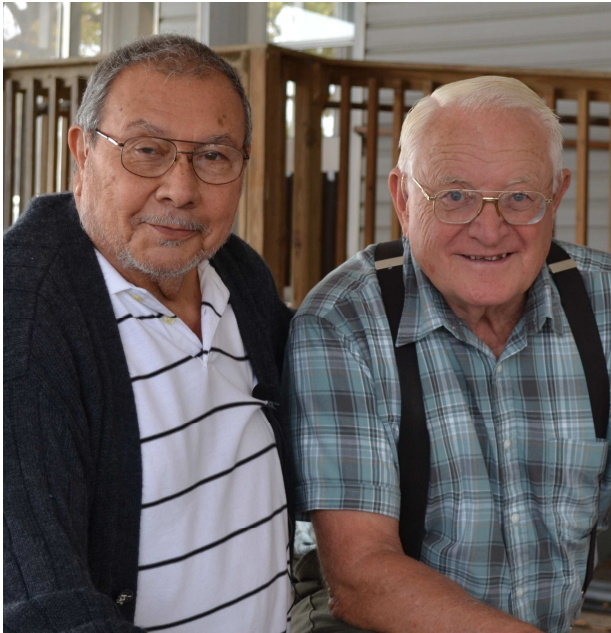
The “Golden Auctioneers”!