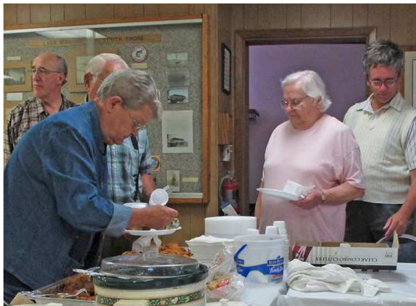
Time to eat! There was plenty to choose from