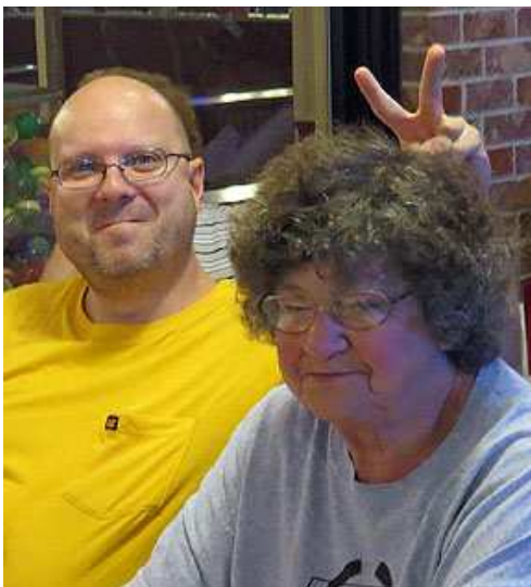
One in every crowd, isn't there? Dee seems to be tolerating him ok