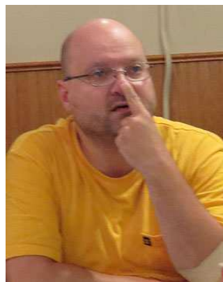
"If I did, you can hit me right here!"