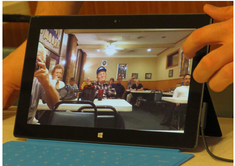
Freeman shot a picture of the group as he demonstrated the little Surface RT. Nice, sharp photo of the interested group!