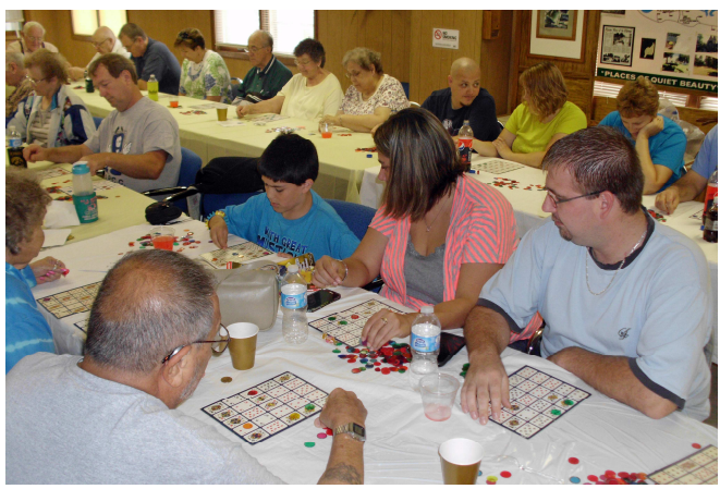
We all enjoyed playing. There were quite a few Gold Dollar winners yelling "Pokeno!"