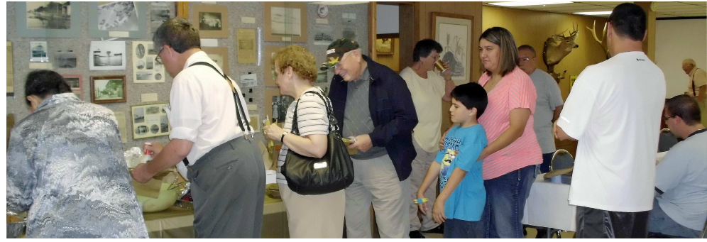
Finally, those words everyone was anxious to hear... "Chow's On!" We won't attempt to name each individual who attended but needless to say, we didn't hesitate to form the chow line. It all smelled so good, and looked even better. Let's eat!