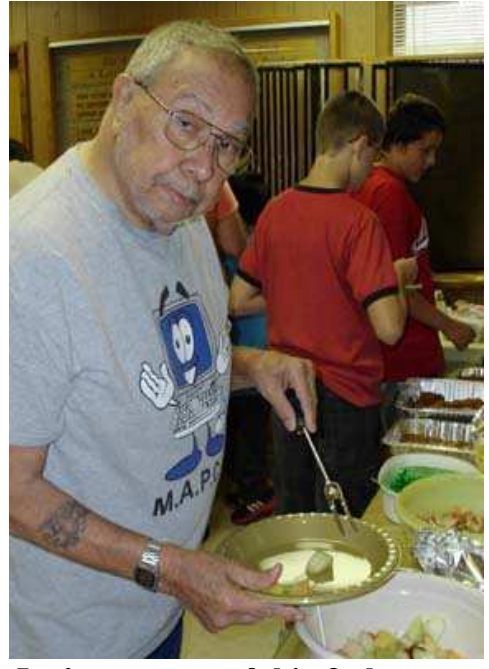
Let's see, some of this & that, etc.