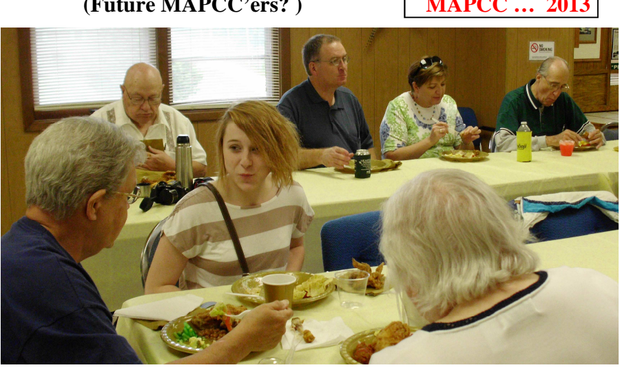
Enjoying the food and conversation with friends and family.