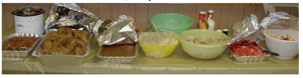
We had a great selection of food including fried chicken, ham, baked beans, meatballs and WAY too delicious salads and deserts:0)