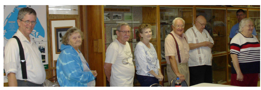
It's a pretty fair-size hall and the chow line stretched the full length and then some. Hungry looking bunch, eh?