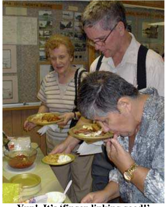
Yup! It's 'finger-linking good!'