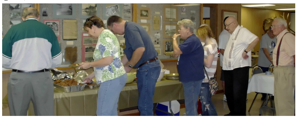
It was a test, trying to decide what to choose... so most took a dab of this and a dab of that.... We didn't want to miss out on anything!