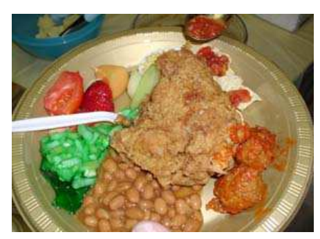
Nice looking plate, eh?