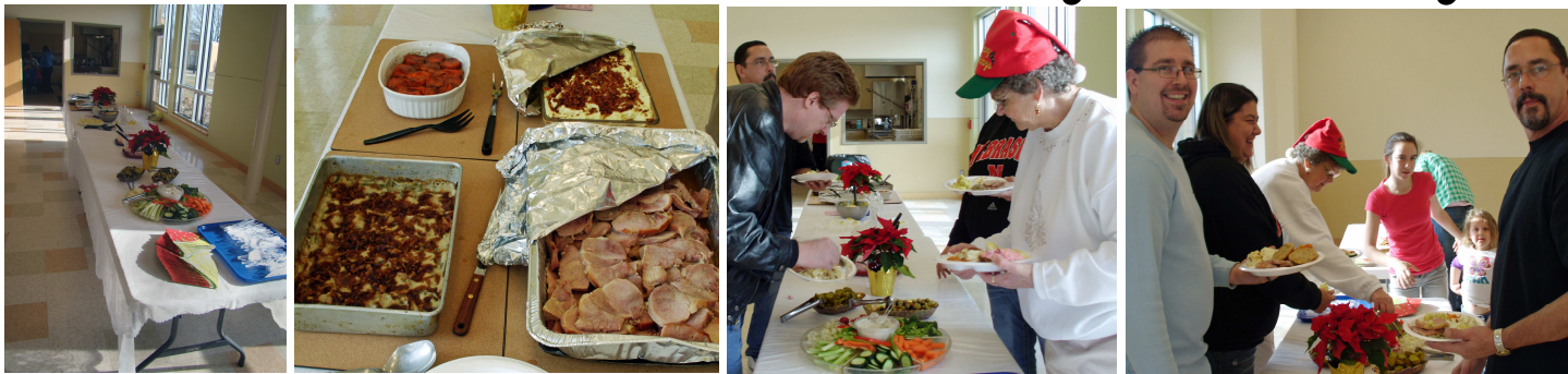
If you missed our 2013 Christmas Party, you missed a fine time! Plenty of food and Pokeno GOLD dollars!