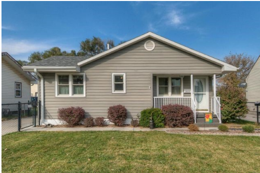
3022 3rd Ave.