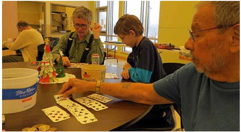
...And another $10.00 WINNER IS.....