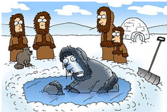
Another Eskimo baptism gone bad...

Sorry if I've taken up more than my corner; but "them's my thoughts, folks!:" .....Joe