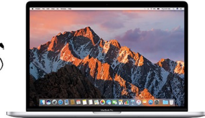
Apple MacBook Pro

I have to admit, ever since Microsoft released the Surface Pro laptops, I have been a fan of these travel-friendly and light two-in-one machines. I have written about my experience with the Surface Pro 2 from a photographer's perspective a while back, then we wrote a detailed Surface Pro 3 review and my experience with the first generation Surface Book pretty much sealed it for me as a very desirable machine for working on the go, thanks to its excellent performance, flexible design, a built-in memory card slot, superb touchscreen experience and plenty of connectivity options. Earlier this year Microsoft finally released the Surface Book 2, a second generation laptop specifically designed to challenge Apple's MacBook Pro. Since it was about time to start replacing my aging Surface Pro 3, I wanted to evaluate both the new Surface Book 2 and Apple's MacBook Pro to see which I would pick for my photography needs. So I bought both laptops and decided to run them side-by-side to see which one would be more suitable to use for traveling and post-processing images. In this article, we will take a look at both the Surface Book 2 and the MacBook Pro and see how they stack up