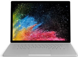
Microsoft Surface Book 2